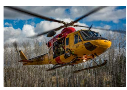
417 Squadron Griffon Helicopter

The Alumni has made contact with the SWO at 417 Squadron and once restrictions are lifted on base for visitors, the unit will welcome us back for a tour. It is unknown if Maple Flag will occur in 2023. With the war in